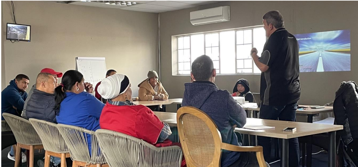
Figure 3: Structured Communication and Training Session

given Coricraft real-time visibility into operations, strengthened accountability, and supported continuous improvement. These changes are driving more informed, data-based decisions and reinforcing a culture of measurable performance across the factory.